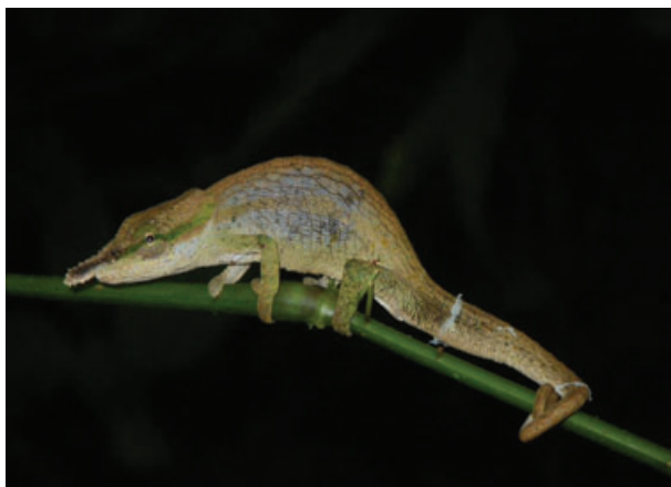
Figure 1. Male specimen of Calumma guibei from the Tsaratanana Massif, Madagascar, in life. Note the rostral appendage that is flexible and dermal (no underlying bony structure) in all species of the C. nasutum group, and the small occipital lobes which are characteristic for the species of the C. boettgeri complex.

subset of species, additional evidence from morphology or nuclear genes was available; following Vieites et al. (2009) we use the terms confirmed candidate species (CCS) for lineages supported by at least two independent lines of evidence, and deep conspecific lineage (DCL) if the available evidence rejects evolutionary independence and thus species status.