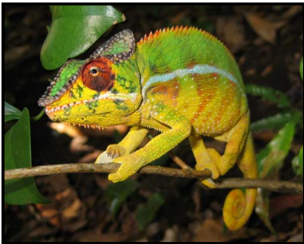
FIGURE 3. The chameleon Furcifer pardalis , commonly encountered throughout the massif Montagne des Français in northern Madagascar, including the mangrove system.