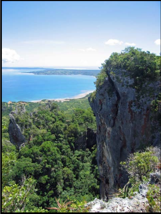
FIGURE 1. Montagne des Français is one of the calcareous massifs (known locally as “tsingy”) located in the extreme north of Madagascar.

received by Antsiranana, which has a mean of 980 mm (Nicoll and Langrand 1989). As a result the vegetation of Montagne des Français is of a distinctly more mesic type than that of its surroundings, and has been described as transitional between mid-altitude rainforest and dry deciduous western forest (Ramanamanjato et al. 1999). Due to its close proximity to the town of Antsiranana, the majority of forest varies from semi-disturbed to anthropogenically altered habitat with little pristine forest remaining. The forest of this massif is completely isolated from the major dry deciduous forest block of the west and the major rainforest block of the east. It is also completely isolated from three of the five other major localized areas of forest (Ankarana, Daraina, and Montagne d’Ambre) located in the extreme north of Madagascar and partially isolated from the remaining two (Analamera and Orangea). It has been suggested that human invasion [estimated at approximately 2000 years ago (Burney et al. 2003)] and subsequent anthropogenic deforestation is responsible for this current isolation (Ramanamanjato et al. 1999; D’Cruze et al. 2006).