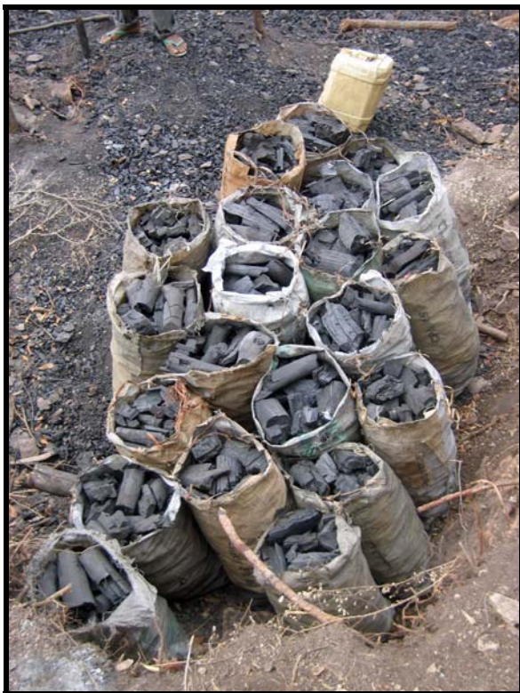
FIGURE 4. The result of charcoal production in Montagne des Français .

Conclusion. —The data collected in this study contributes to our current understanding regarding patterns of biodiversity of Malagasy herpetofauna by fully documenting the species composition of an unsurveyed site that has already been identified as a threatened area of high biodiversity requiring full protection (ANGAP 2003; Glaw et al. 2005a,b; Ministère de l’Environnement, des Eaux et Forêts 2006; Robinson et al. 2006). The extremely high level of endemism seen in the herpetofauna, at both the regional and national level, immediately emphasizes the importance of Montagne des Français as a biological refuge. Furthermore, many of the species encountered during this study appear to be dependent on forest habitat, and do not appear to thrive in degraded or more open habitats. Only by conserving this area of forest will we be able to safeguard against future herpetological extinctions at this location. Moreover, we would like to reiterate the extraordinary conservation importance of this northern-